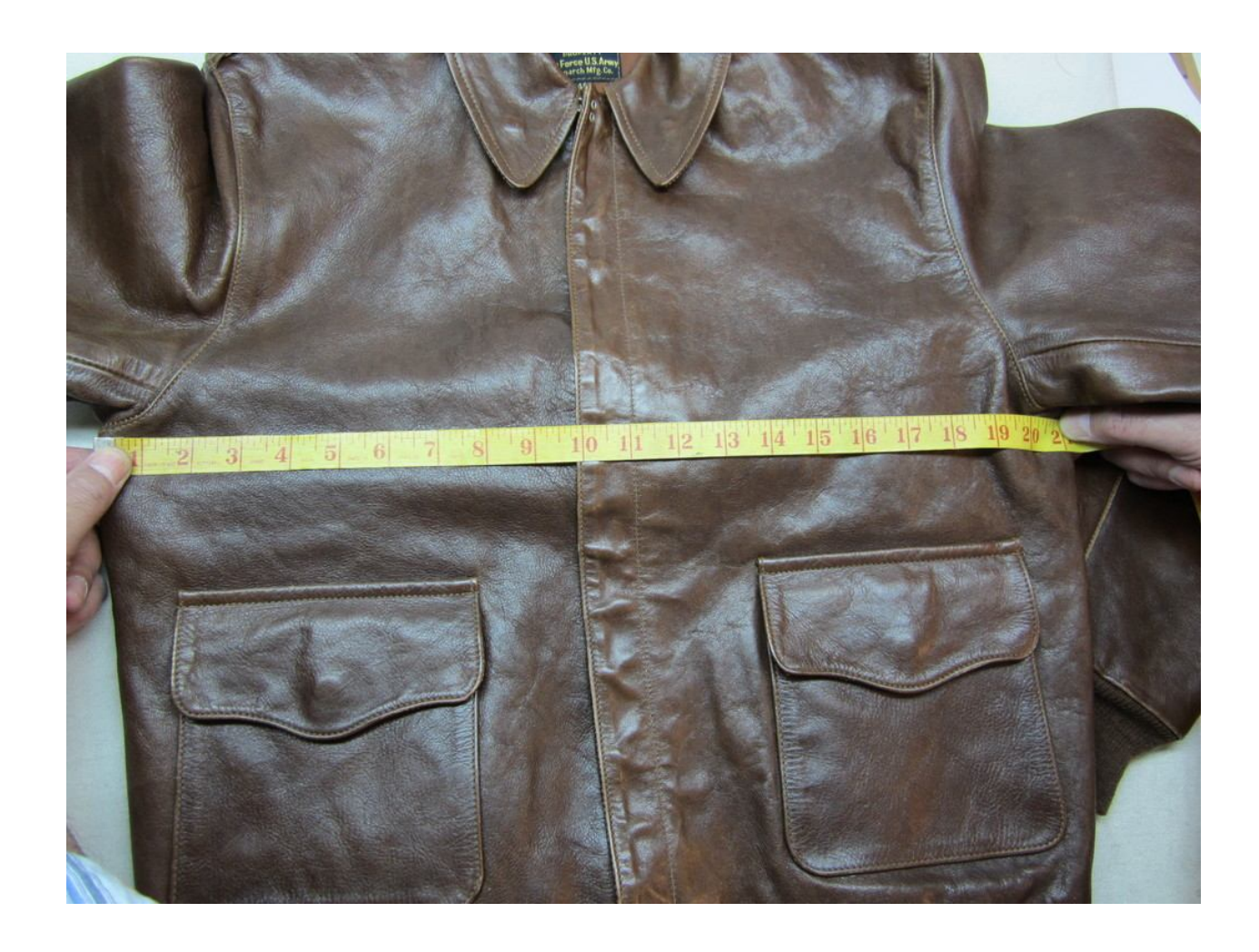
<u>Pit to pit</u>. Grab the jacket under the armpits and pull until it becomes straight. Don't pull to hard you don't want to stretch it. My photo isn't the best, left side OK, right side not perfectly straight, but anyway, that's how the pit to pit measurement is taken.