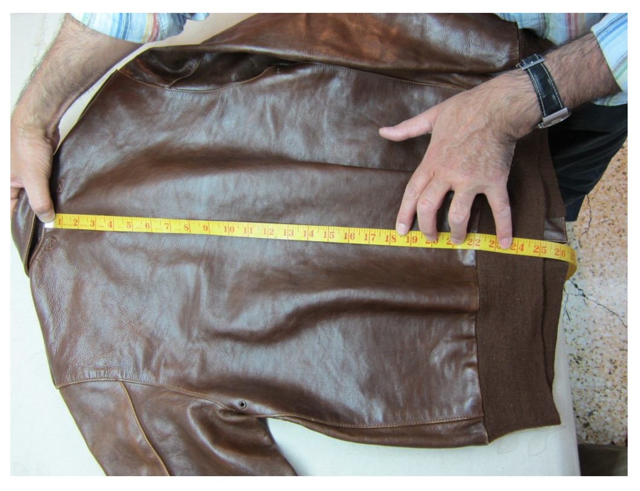
Back. Put the measuring tape at the bottom of the collar and making sure the jacket lays completely flat, run the tape over it until the end of the knitted waistband. Simple.