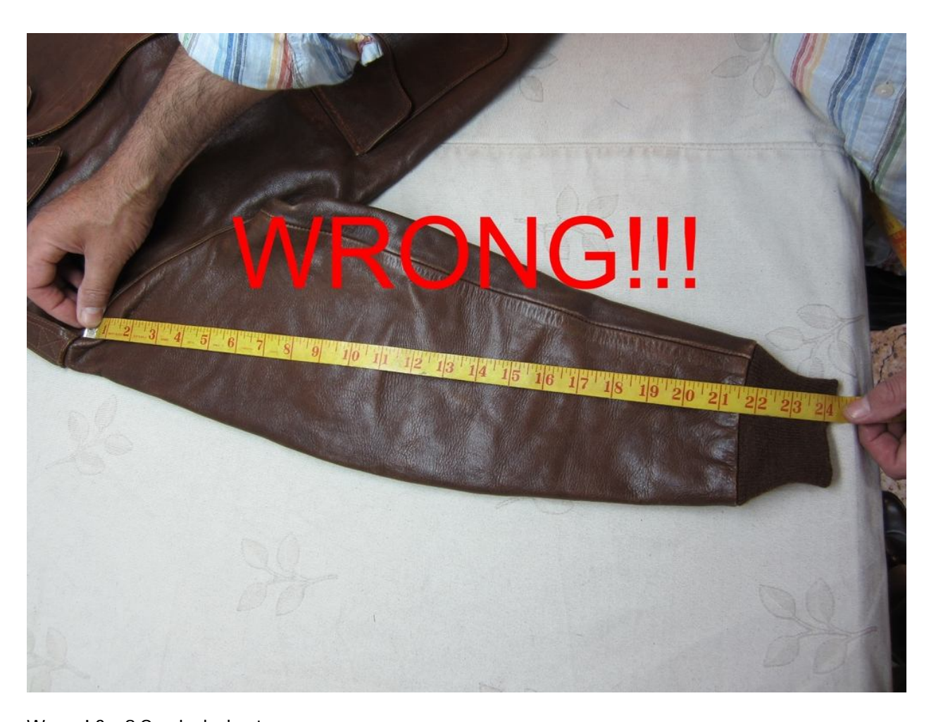
Wrong! See? One inch shorter.